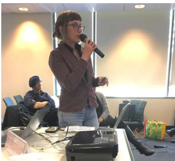
March Social Event