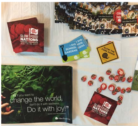
November Social Meeting