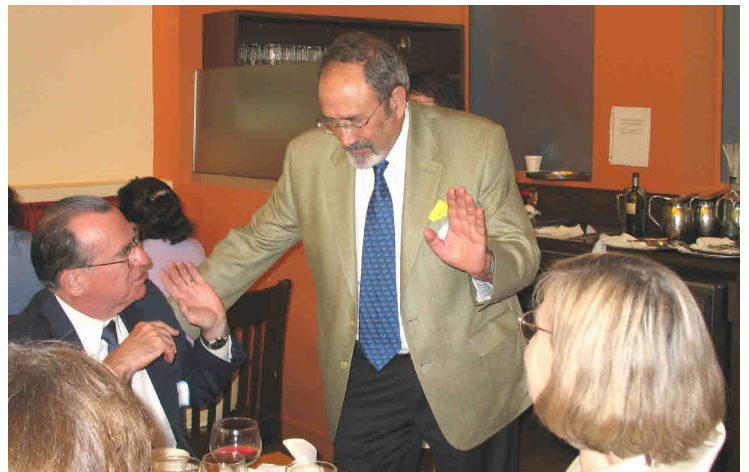
Secret ICS Hand Gestures