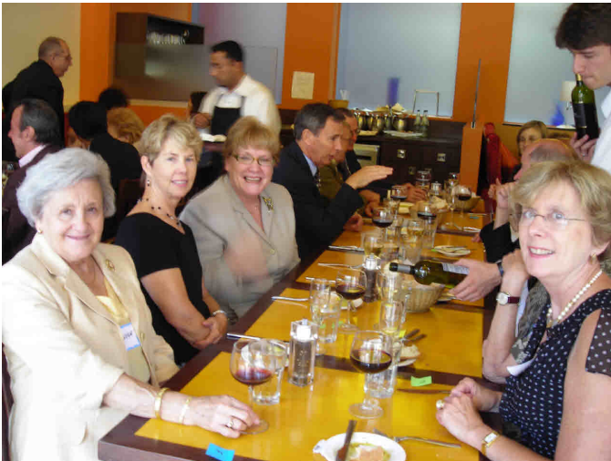
Abruzzi e Molise in Crystal City