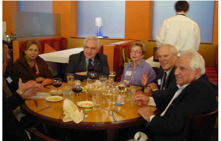
The Media and Friends