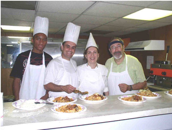
The Pasta Team