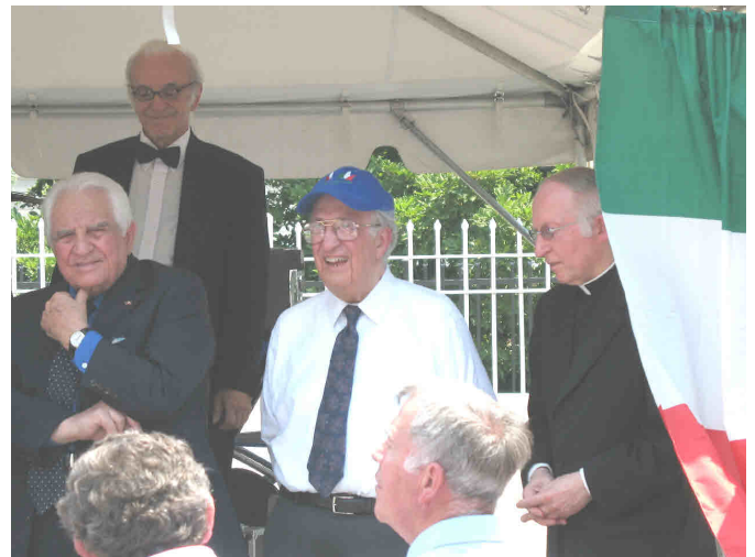
The VP and the VIPs