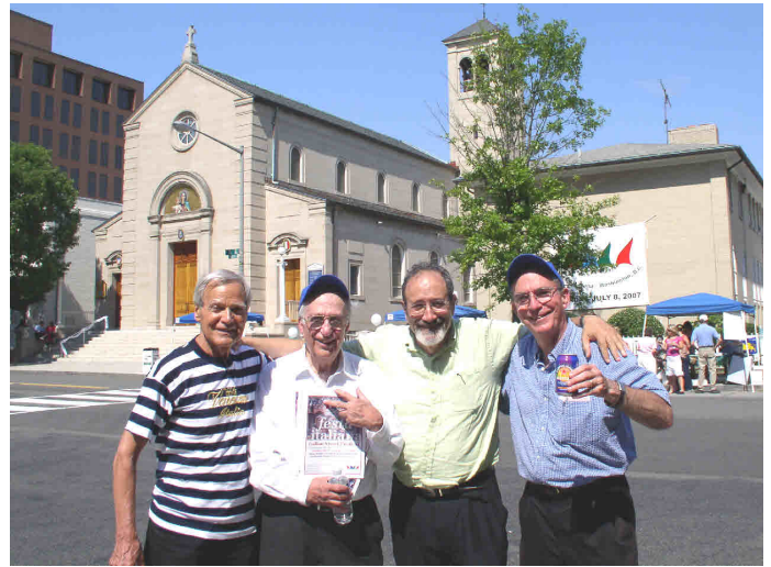
The ICS Team Toasting Success